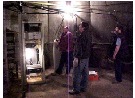
As the work progresses the "boys" see the light.

Well, I hope you've enjoyed this little visit to the scenes behind the WARA repeaters. I also hope it helps you to understand the work a few dedicated individuals do for the many of us who sometimes take for granted that the carrier will always be there when we "push to talk". Don't wait for the beep!