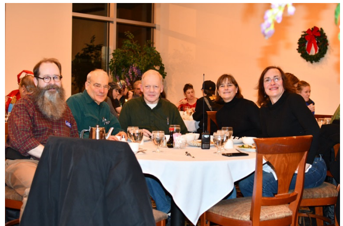
More fun here at table #4...