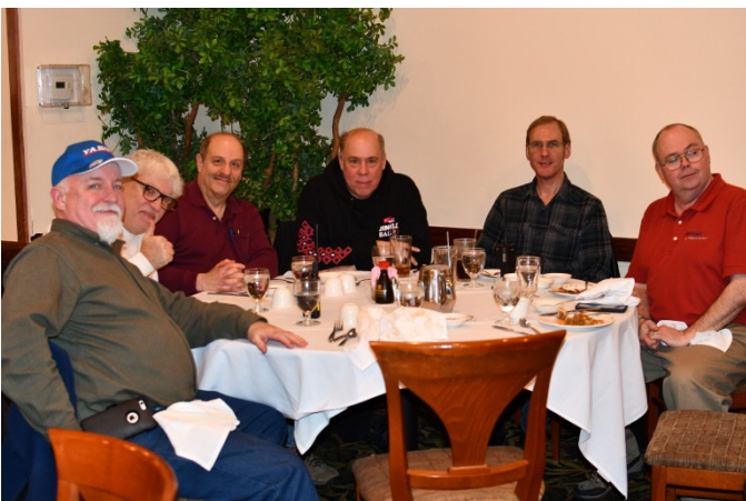
More Party animals – table #2