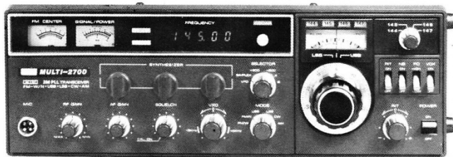
KLM, Multi 2700 All mode

How many of you remember this KLM?? If you owned one in 1978, you had one of the best 2M radios of its time. List Price: $756.00.