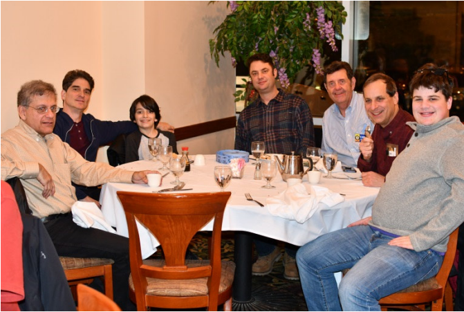
The usual suspects – table #1

The annual holiday party took place at Sichuan's Garden in Waltham. Always a popular event.