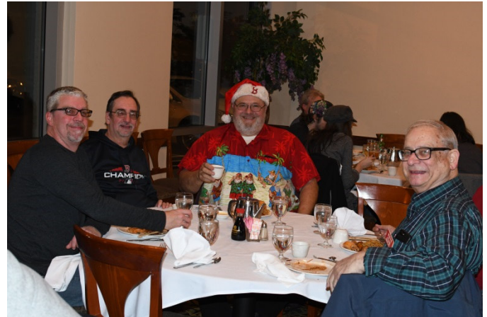
An appearance from Santa himself at table #3!!