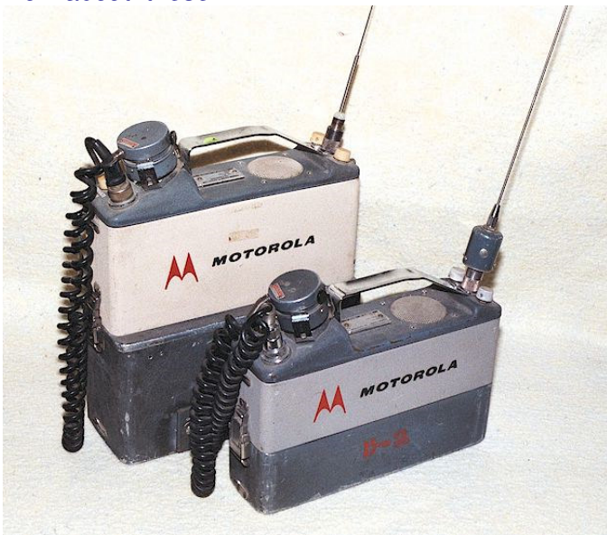
Motorola FPTR series portables. Battery powered 5W tube type radios available for low band and high band.