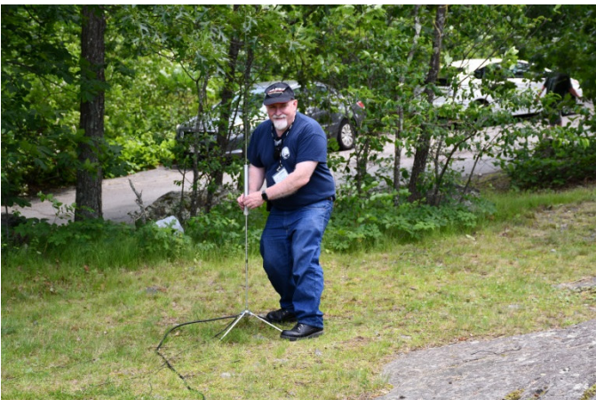
Hey Ned; push it a little more up – W1NED adjusting his vertical.