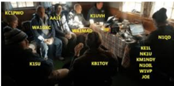
Boston ARC Winter Field Day Crew