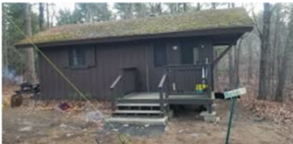
Ponkapoag AMC cabin