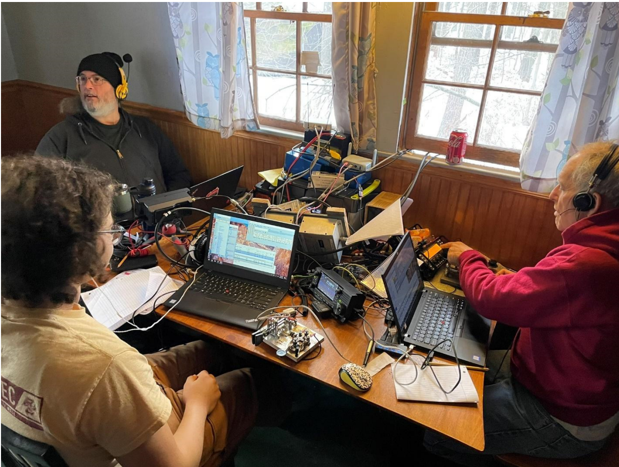
The 3 HF stations sharing a small table in one of the cabins

To hear and see a bit more about this adventure, attend the 2/26/2025 WARA meeting. For more info on Winter Field Day, see https://winterfieldday.org/ .